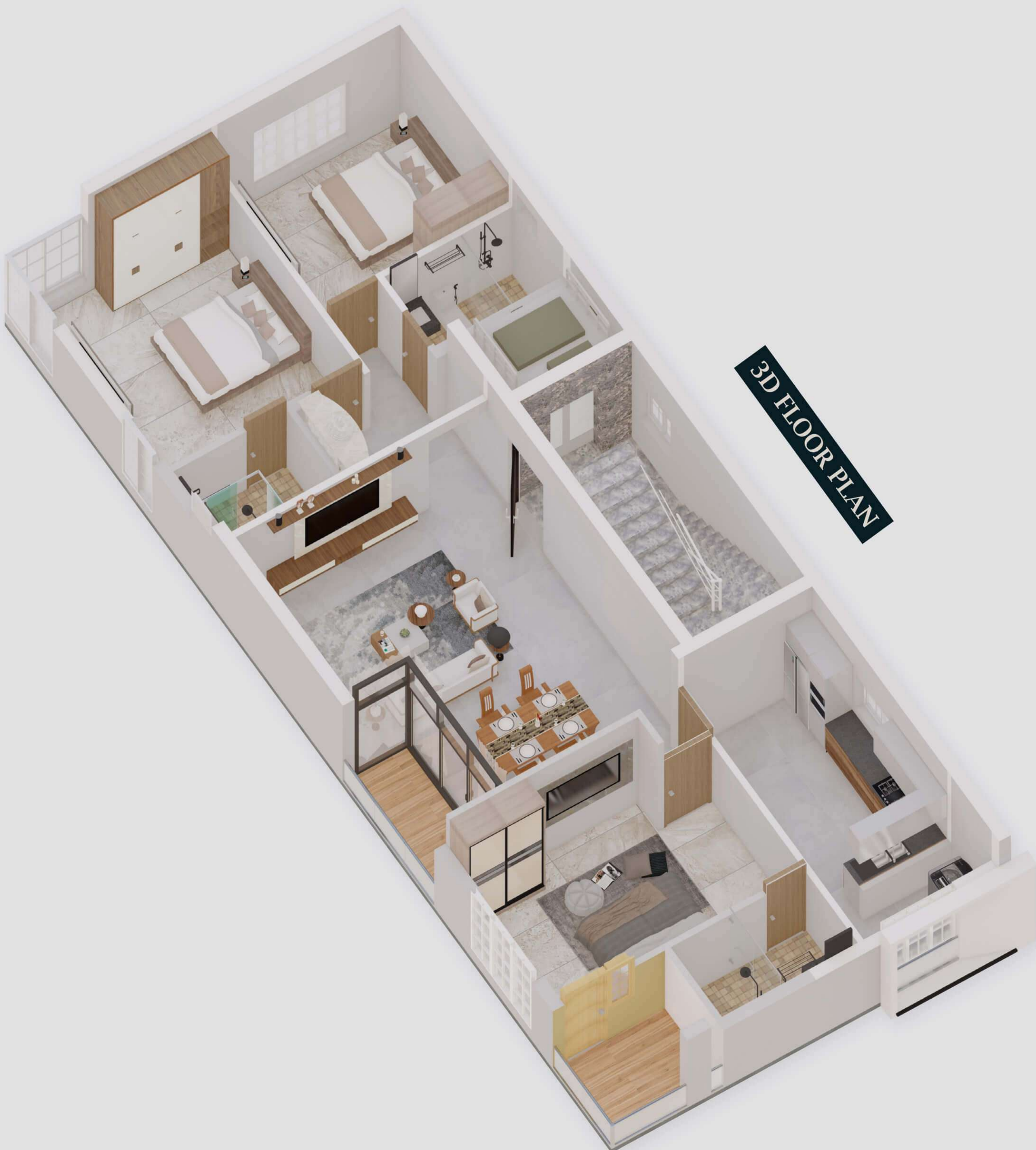
3D FLOOR PLAN